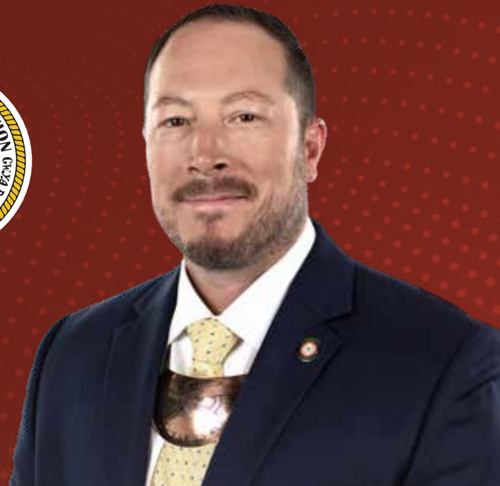
PRINCIPAL CHIEF CHUCK HOSKIN JR.